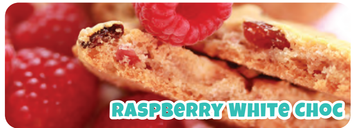
RASPBERRY WHITE CHOC